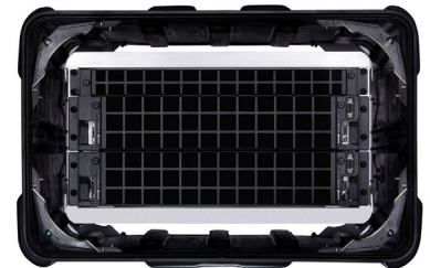
Tactical Analytics Anywhere Appliance (T-AAA)

The Tracewell T-AAA underpins the Dell Technologies Platform making it possible to deploy complex and scalable AI architectures in a wide variety of rugged and tactical edge environments. The system is based on the Dell EMC PowerEdge R640 (other Dell EMC PowerEdge servers are available), the company's market leading, enterprise-class rack server technology. Tracewell has transformed the standard PowerEdge R640 into a short-depth server that is electrically identical to a standard, off-the-shelf Dell EMC product, providing a familiar platform and a consistent set of hardware from the traditional data center to the edge.