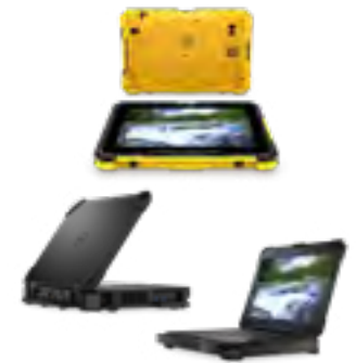
Latitude 7000, 5000