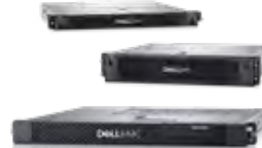
PowerEdge XR2, XR11, XR12