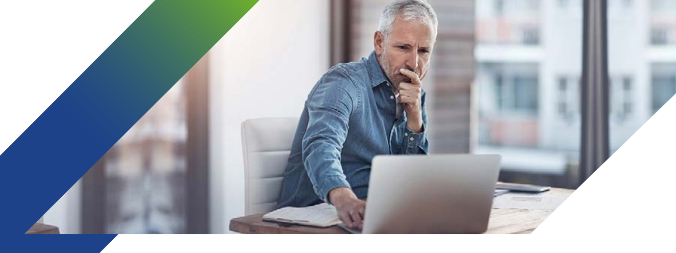
Al will be the most challenging technology to implement, say more than one-third of government CIOs.